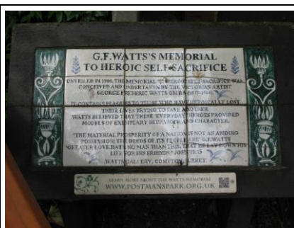
Memorial to Heroic Self-Sacrifice